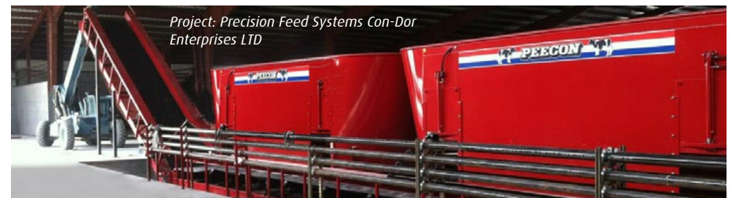
Project: Precision Feed Systems Con-Dor Enterprises LTD